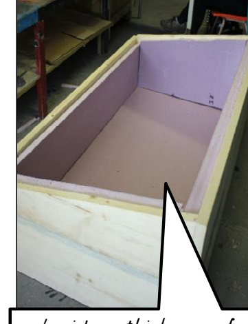
Inside, a thickness of polyurethane insulation is added

The upper part is made of 2x4, 2 boards of 6 feet long and 4 boards of 3'1" wide